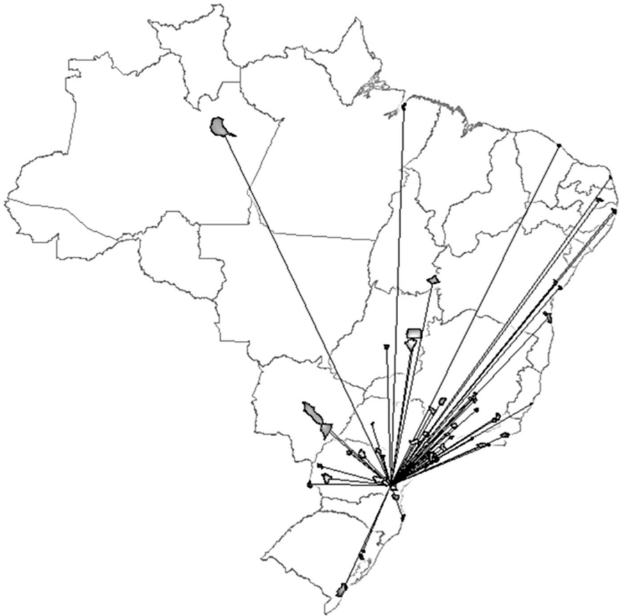
Fig. 2 Presentation of the geographic distribution of the pledges received by Project No. 1. This figure shows the geographic distribution of donors pledging capital to Project No. 1, which attracted 396 pledges for a total of R$ 29,400. The most distant donor in Project No. 1, which is located in Curitiba/PR, was in the city of Manaus (Amazonas State); this donor corresponds to a distance of ~2825 km. Country: Brazil

the influential observations and atypical cases (cases with standardized residuals >2.5 ) generated overestimations of the model. To this end, we tested the model after discarding cases where the residue was >2.5 . The direction of the relationship between the variables and the significance remained the same. Sixth, we generated models by replacing the independent variables with their natural logarithms, and the results remained very close to the original model. Seventh, to see whether there was any significant influence of the projects on the relationship between the variables, we ran a model with nine dummy variables ( n-1 projects) as a control. The results still remained close to what was found in the original model.