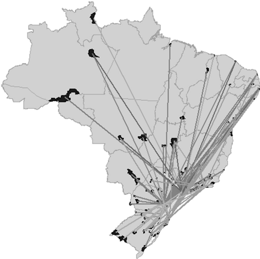
Fig. 4 Geographic distribution of all pledges (to projects hosted on the Catarse website). Note this figure shows the geographic spread of the 1835 pledges made to the 10 projects we examined, which are based in six different Brazilian cities: Curitiba (2), Florianópolis (1), Itapema (1), Niterói (1), Rio de Janeiro (1) and São Paulo (4)

the start of their careers predominantly revolves around their network of close contacts. The Catarse platform states on its website that at least 50 % of the funds directed at projects come from the entrepreneur's own network of contacts.