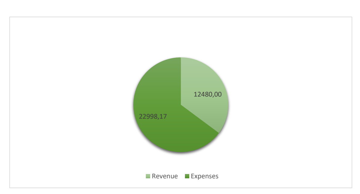
Figure 3. Revenue and expenses for the year: 2013. Cristino Castro (PI), Brazil, 2013.

Shown below, graphically, the impact of the financial resource referring to the value received from the state sphere and the value of expenses to meet judicial orders.