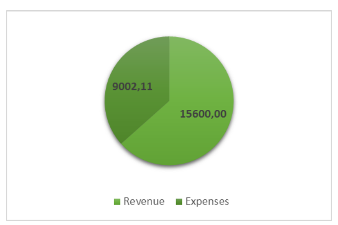
Figure 5. Revenue and expenses for the year: 2015. Cristino Castro (PI), Brazil, 2015.

of R$12,480.00 (revenue / cofinancing - State). There were expenses related to lawsuits of R$ 27,041.40, an amount that exceeded 100% of the revenue referring to the transfer of pharmaceutical assistance.