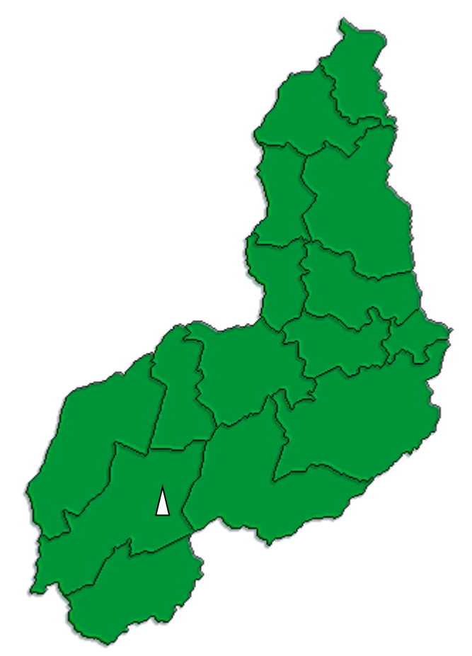
Figure 2. Municipal cases of judicialization. Cristino Castro (PI), Brazil, 2018. The municipality of Cristino Castro-PI is located in the extreme south of the State of Piauí, 600 km from the capital, Teresina.