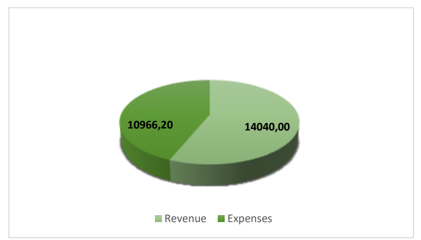
Figure 6. Revenue and expenses for the year: 2016. Cristino Castro (PI), Brazil, 2016.

R$15,600.00 (revenue / cofinancing - State). There were expenses related to lawsuits of R$9,002.11, corresponding to 57.70% of the revenue referring to the transfer of pharmaceutical assistance.